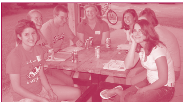
Psychology students enjoy themselves at the Psi Chi fall picnic.