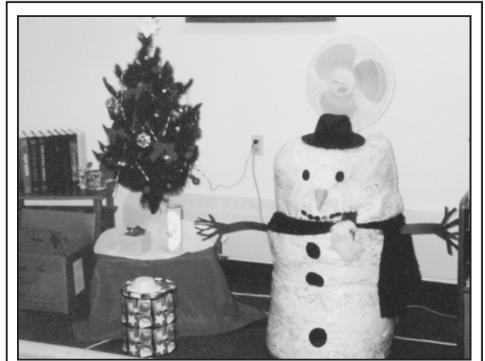
"Mr. Shredded Paper Snowman" greets visitors to the department office.