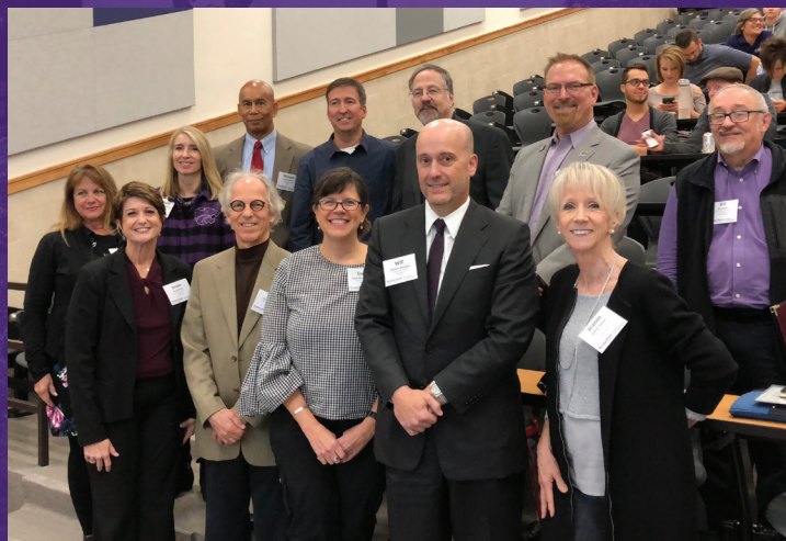
Alumni Advisory Council Meeting.