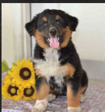
The Bailey's new puppy, Ahsoka