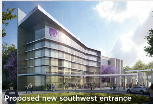
Proposed new southwest entrance

Supporters and friends can help support the project through the Union Excellence Fund at union.k-state.edu .