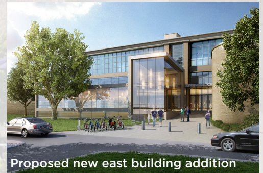
Proposed new east building addition