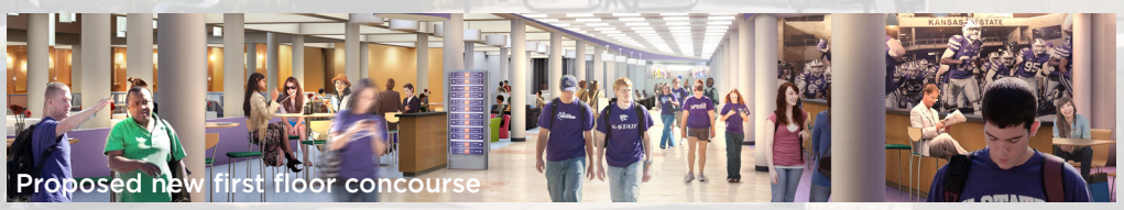
Proposed new first floor concourse