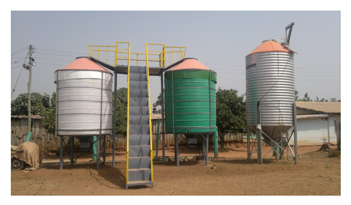
Figure 3: Plastic water tanks modified into silo for long term storage of maize in Ejura, Ghana (metal silos on the right was donated from a Brazilian company and additionally tested).