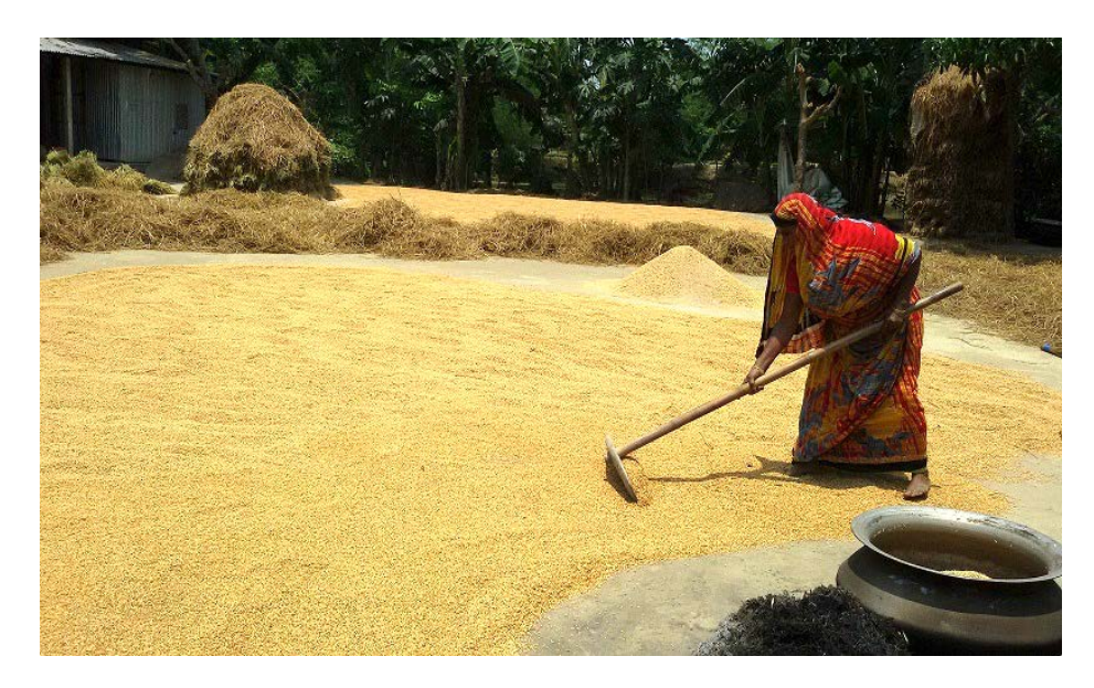
Figure 1: A woman in Bangladesh spreading rice paddy for open air sun drying.