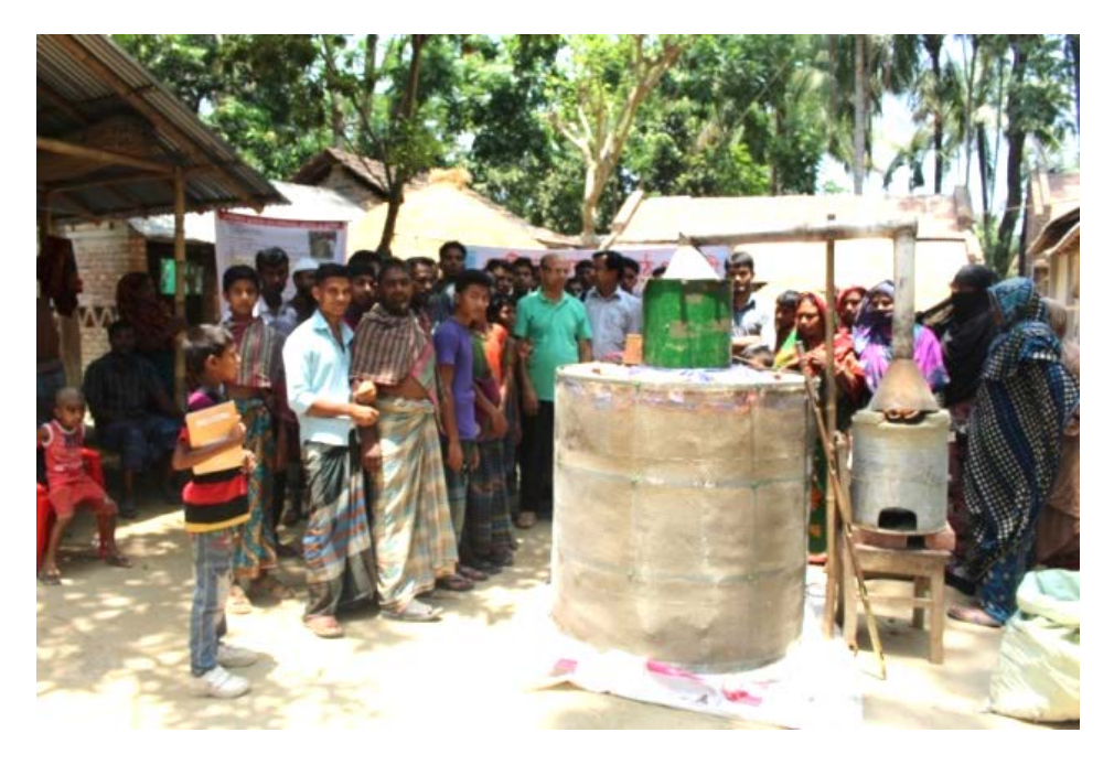
Figure 2: STR dryer demonstration trials in Spring 2016.