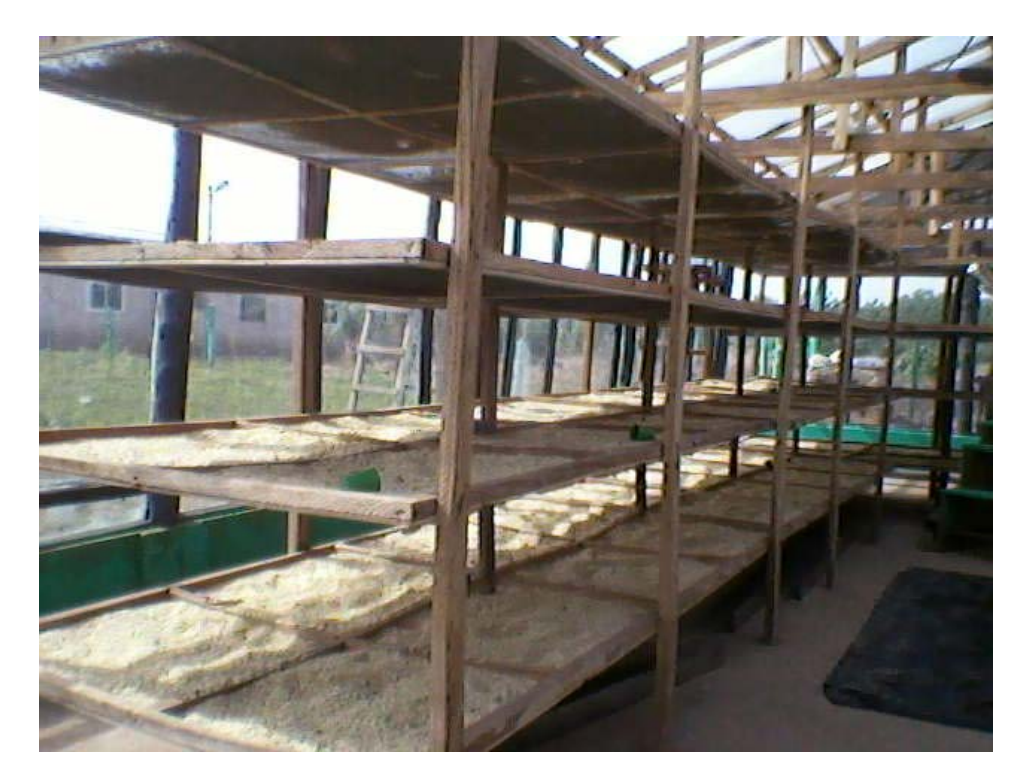
Figure 2: Shelves stacked with maize harvest in the biomass hybrid solar dryer in Ejura, Ghana.