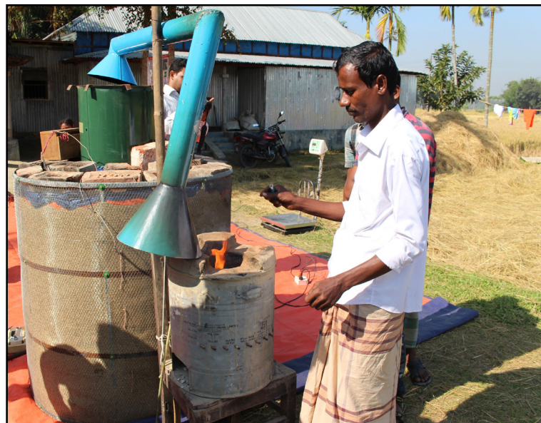
The BAU-STR Dryer

Drying of paddy rice in Bangladesh traditionally happens in field and on farm, leaving it open to contamination from pests, dirt and dangerous fungal toxins. Post-harvest loss at the farm level is estimated to be about 14%, with drying and storage losses a key component of these losses.