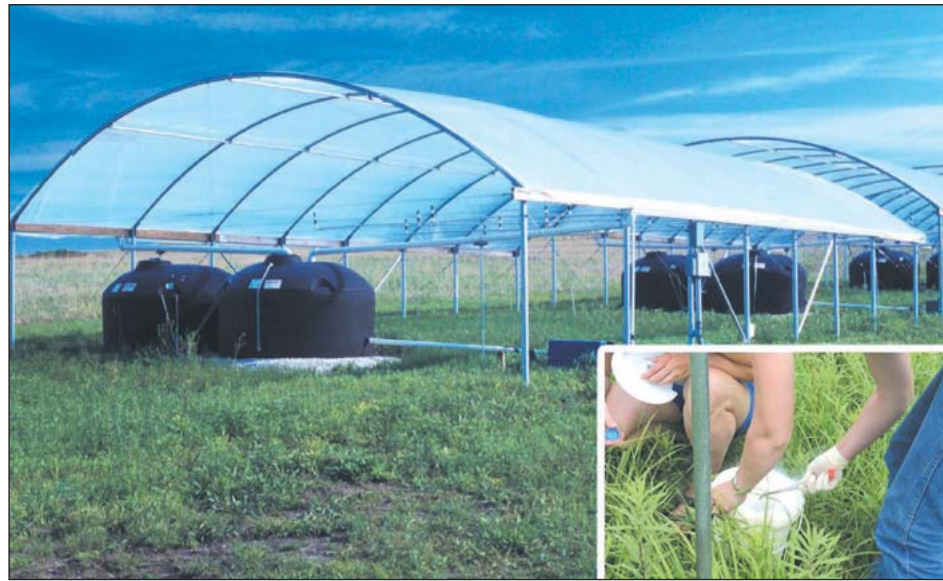
Figure 1. A rainfall manipulation plot (RaMP) consists of native tallgrass prairie covered by a rainout shelter that intercepts and stores rainfall for either the application of ambient precipitation or for altered precipitation, in which the interval between ambient rainfall events is increased by 50%. Inset: A. gerardii leaf samples were flash-frozen in liquid nitrogen in the field for later RNA extraction and microarray analysis of transcription profiles.

During the growing season in which we conducted this microarray experiment, the altered precipitation plots experienced lower average growing season volumetric soil water content (19%) relative to ambient plots (27%), even though both received similar total amounts of rainfall. Prior to leaf tissue sampling for microarray analysis on September 15, 2003, ambient plots received five pre-