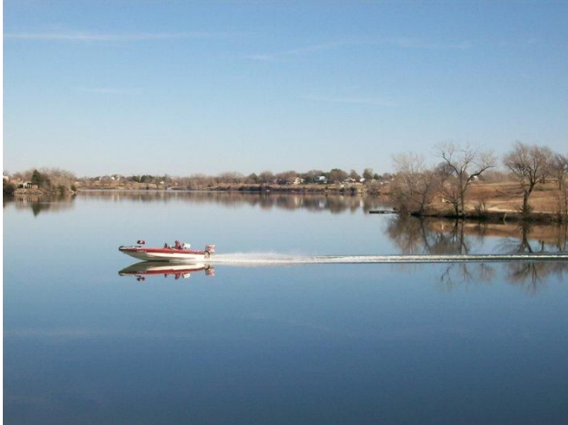
Figure 2. Marion County Park and Lake view

The first step of this project consisted of quantifying the fragmented land patches within the park by labeling a high resolution satellite image with the Matlab (Mathworks, Natick, MA) Image Labeler software. There are 48 patches that were mapped for Marion County Park. The satellite image was obtained from Google Earth and had a size of 4800 \times 2886 pixels. Patches between roads were extracted using Matlab Quantifying changes in patch metrics over time could be a useful indicator of biodiversity changes in fragmented landscapes. Spatial attributes of patches affected by habitat loss and fragmentation over extended time-periods can use methods involving, aerial image acquisition and processing, classification of land cover classes and quantification over land cover loss, quantification of grassland fragmentation, and influence of roads on edge effects of fragmented grassland patches (Niemandt et al, 2016).