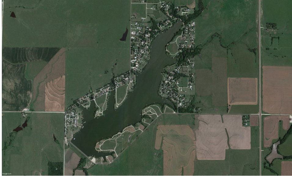
Figure 3. Aerial image of Marion County Lake and Park (Google Earth Pro).

In this study, the divisions of patches were then classified into pervious and impervious roads. In this study, pervious roads were designated as roads that are porous and allow for water to penetrate through. These were the smaller gravel roads which branched off from the main blacktop road. The larger paved roads constructed of asphalt were designated as impervious roads. The entire waterbody of Marion Lake was labeled, and finally, docks were labeled and accounted for. This was an important step as it seemed that most of the impervious network of roads lead to areas nearby docks. Labeling this into separate categories gives a better understanding of the number, size, and shape of fragmented areas.