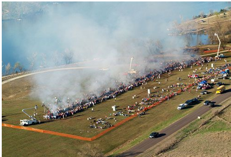
Figure 1. Overhead image of people roasting marshmallows at Marion County Park and Lake (Marion County Park and Lake, 2012).

Marion County Park and Lake is near the center of Kansas and an hour south of Manhattan, KS (38°18'54"N 96°59'31"W). The park and lake encompasses about 300 acres of land. The lake accounts for a little over half of the 300 acres with depths as large as 40 feet. The park and lake were officially opened to the public in 1940 and now about 275 homes and cottages have been built around the lake. There are also four miles of asphalt roads with many gravel roads (gravel is AB-3 which is crushed limestone) that lead to camping grounds or other parts of the park. The lake functions as a boating, sail boating, swimming, fishing, and scuba diving lake. The park has many areas for camping, bird watching, and picnicking. In 2012, Marion County Park and Lake actually achieved the record for the most people roasting marshmallows simultaneously. Marion Lake and Park consists of 153 acres of waterfront. Construction of the dam was completed in 1937, with the park opening shortly after on May 26 th 1940. A majority of the Dam and other facilities were built by the Civilian Conservation Corps (CCC). Part of the significance of Marion County Lake and Park is due to it being listed on the National Register of Historic Places.