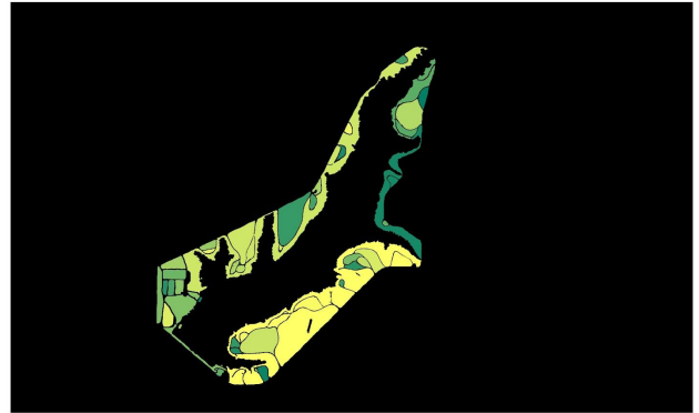
Figure 5. and Figure 6. Labeled Patches of Marion County Park and Lake

The following maps labeled Figure 6 depict areas that are important information for the project to move forward. These maps include: impervious roads, pervious roads, all roads, lake area, buildings, and docks. Important findings from the original image show that the pervious road area is 51,114 and the impervious road area is 38,863. Further analysis showed that 16 percent of the land area of Marion County Park and Lake is covered by roads. Knowing the