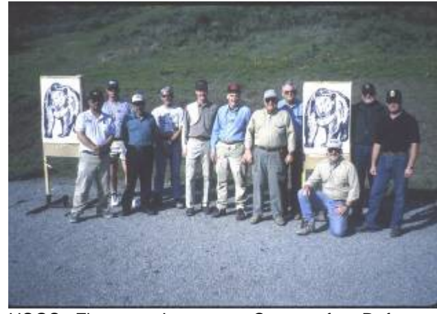
USGS Firearms Instructor Course for Defense Against Wild Animals, Santa Clara CA 2002

USGS Firearms Instructors must be able to independently effectively and teach the fundamentals of firearms safety and safe firearms handling. Instructor certification requires approximately 150 hours of formal training including a USGS Instructor Firearms Class and apprenticing as an assistant instructor. Detailed requirements for USGS Firearms Instructorship are listed in Ch, 29.3, Part D. Firearms Instructors, http://www.usgs.gov/usgsmanual/handbook/hb/445-2-h/ch29.html.