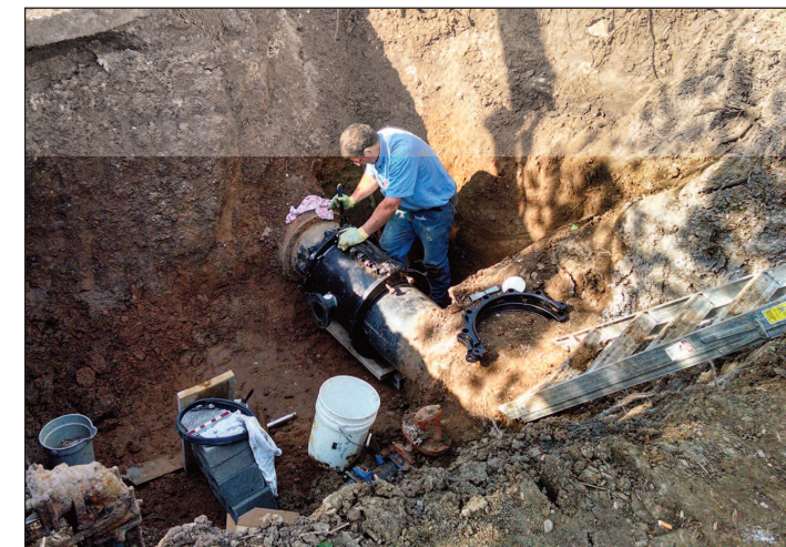
A worker repairs the water main valve to restore the water supply to the KSU Gardens. More information in the Director's column on page 2.

May 19 will be the final meeting of the 2014-2015 Friends Board. The months have flown by quickly. I'm impressed with the unwavering support this board has given to the Gardens this year. I have truly enjoyed serving as the board president and working with our dedicated board members. I want to