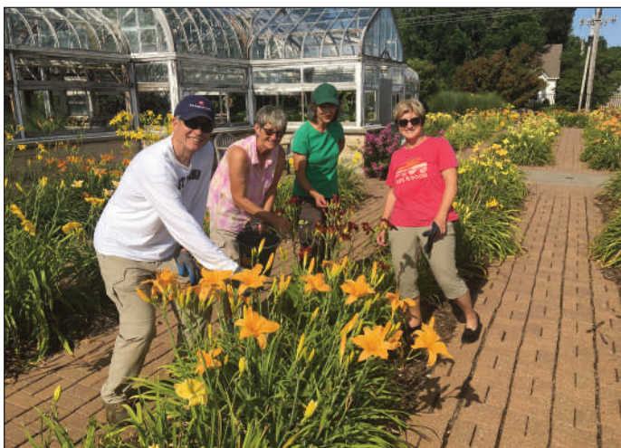
Purple Thumbs hard at work in The Gardens.