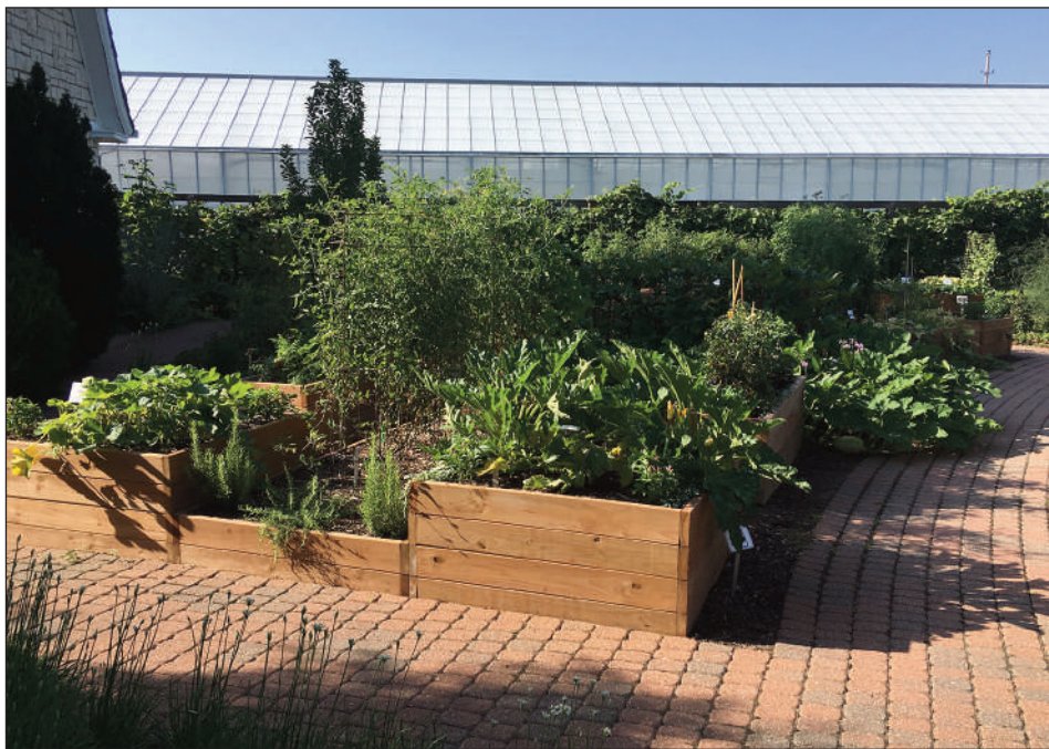
The Awl Thumbs, a group of woodworking volunteers, built these raised garden planters in the winter months of 2019. This summer, the planters are filled to overflowing with fruits and vegetables. Thanks to all of our handy volunteers, they've been a great addition to the Gardens.

Nancy Farrar 2019-2020 Friends Board President