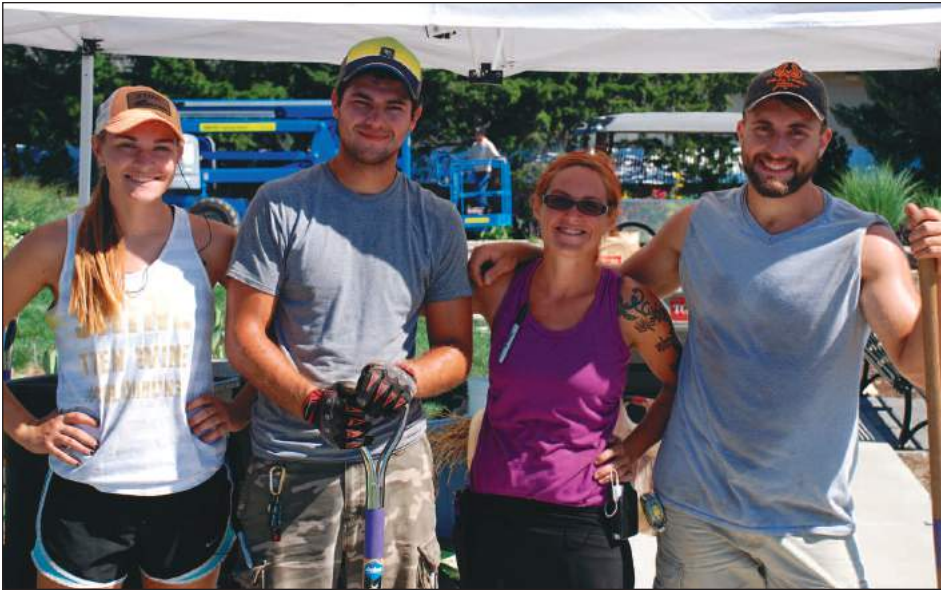
The Gardens summer crew, took a quick break from dividing iris in the late July heat to pose for this shot. They look pretty happy even with the 105 heat index that day.