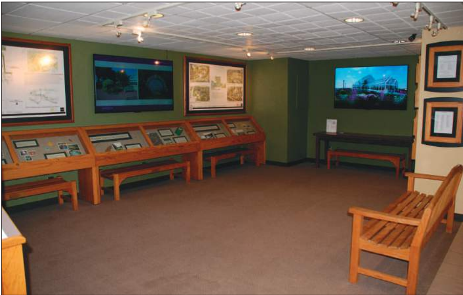
Visitor Center upgrades in progress. The new digital displays (2 of 3 shown here) will provide visitors with various information such as maps, tours, educational videos and much more.