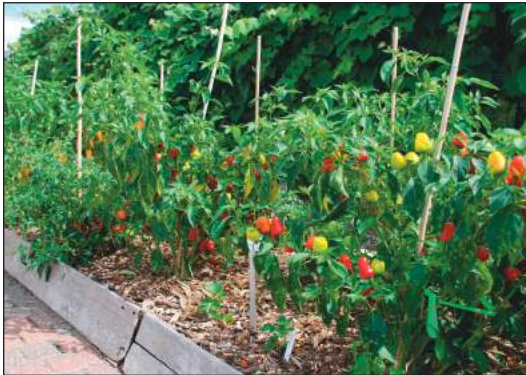
One view of the vegetable garden, with several 'Pretty N Sweet' (an All America Selection) pepper plants. Harvested produce is donated to the Flint Hills Breadbasket.

Nonprofit Org. US Postage PAID Manhattan, KS Permit #221