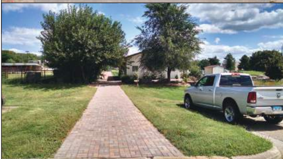
This past spring, the Landscape Construction class finished a paver walkway at the Gardens maintenance building. Inset photo shows the finished product.