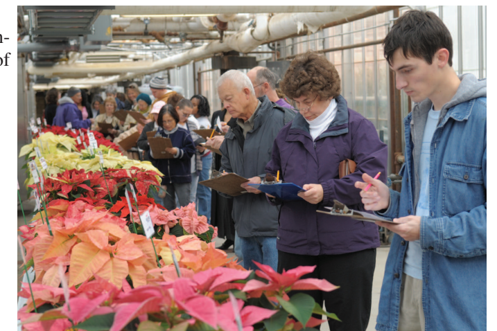
Visitors to the Poinsettia Open House take a survey on the wide variety of poinsettias available this year from the KSU Gardens. More photos from the poinsettia sale on page 5.