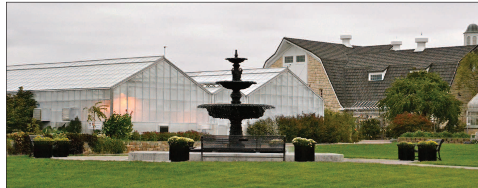
Four black cast iron benches with matching planters were added to the Conservatory Garden Fountain Plaza site in the fall of 2012 (pictured above). Donor plaques are shown below. Take time to relax in the Gardens and enjoy these new benches.