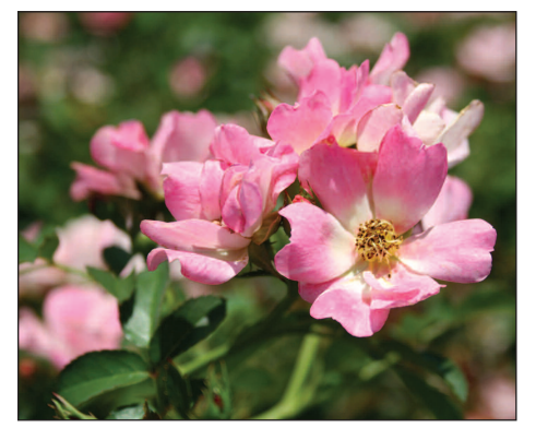
Rosa Drift Red (top photo) and Rosa Drift Pink (bottom).