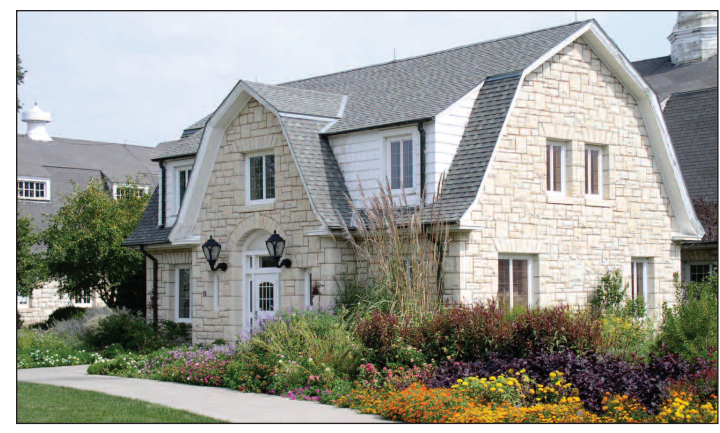
The Kansas State University Gardens are designed as a lifelong learning laboratory to encourage environmental involvement with the university community and the public. An ever-changing display of plants provides an opportunity for education, research and conservation.