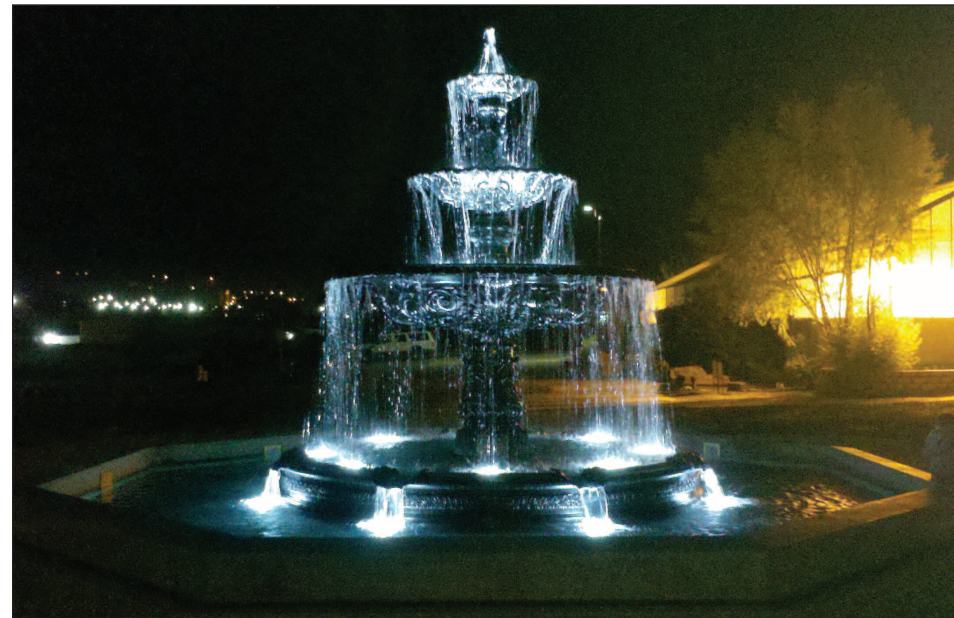
A beautiful nighttime photograph of the newly installed Bidwell Family Fountain.