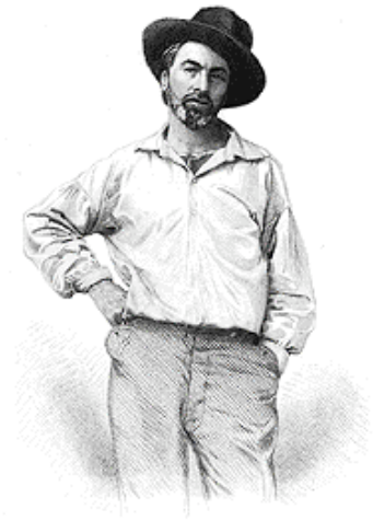
Walt Whitman from Leaves of Grass , 1st ed.

But, precisely because of its difficulty, it will offer rough new prizes. Class will be exciting, even fun. Our discussions will be lively, animated, exhausting. You will have the opportunity to compose the best writing you have ever done. And you will learn so much—about nineteenth-century America and its cultures, about literature and writing, about how to read texts that are strange and difficult because they are distant from our present.