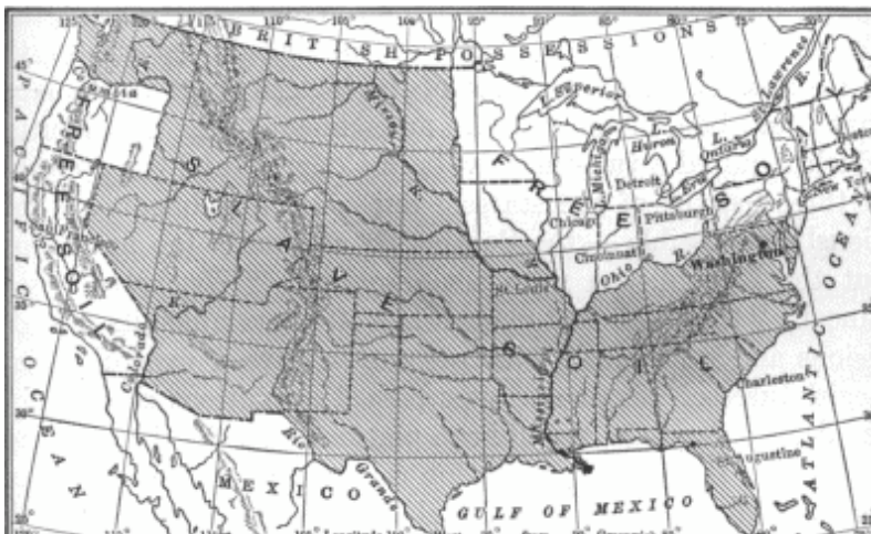
"Slave and Free Soil on Eve of Civil War" from Charles A. Beard & Mary R. Beard, A History of the United States

removal, slavery and abolitionism, the Civil War and its aftermath, immigration, lynching and Jim Crow, Pragmatism, and imperialism.