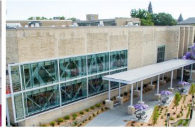
VI. Facilities and Infrastructure