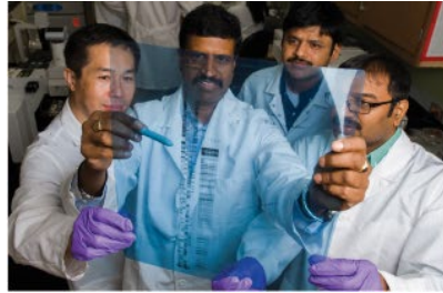
I. Research, Scholarly and Creative Activities and Discovery