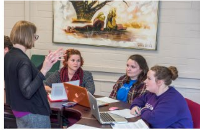
V. Faculty and Staff