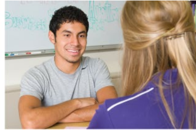
II. Undergraduate Educational Experience