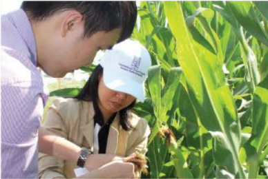
IV. Engagement, Extension, Outreach, and Service