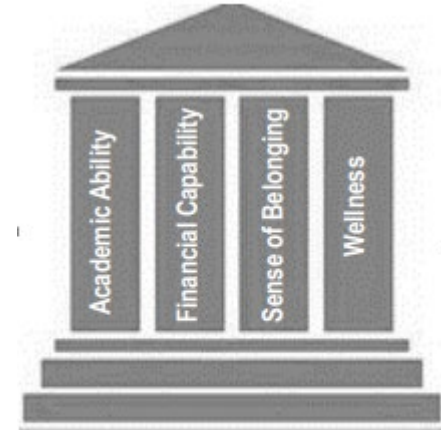
Student Success Pillars