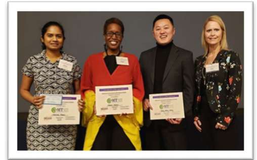
MAGS 3MT Award Winners