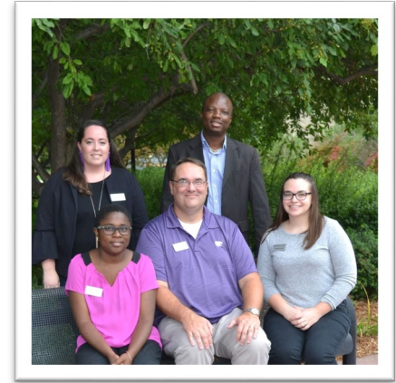
2019-2020 GSC Officers