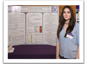
2019 CGRS Award Winners