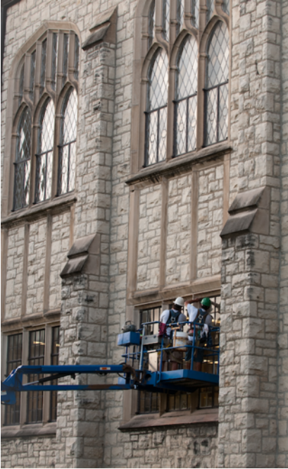
K-State Photo Services